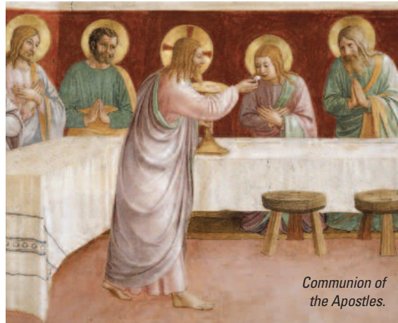
Communion of the Apostles.

This surge of emotion is what drives her to turn to Jesus with the passion with which she says, “Rabbouni! Teacher!” In fact, Mary’s answer was entirely the fruit of the way she heard herself called by name, entirely flowing from that unique upheaval that Jesus provoked in her. ►►