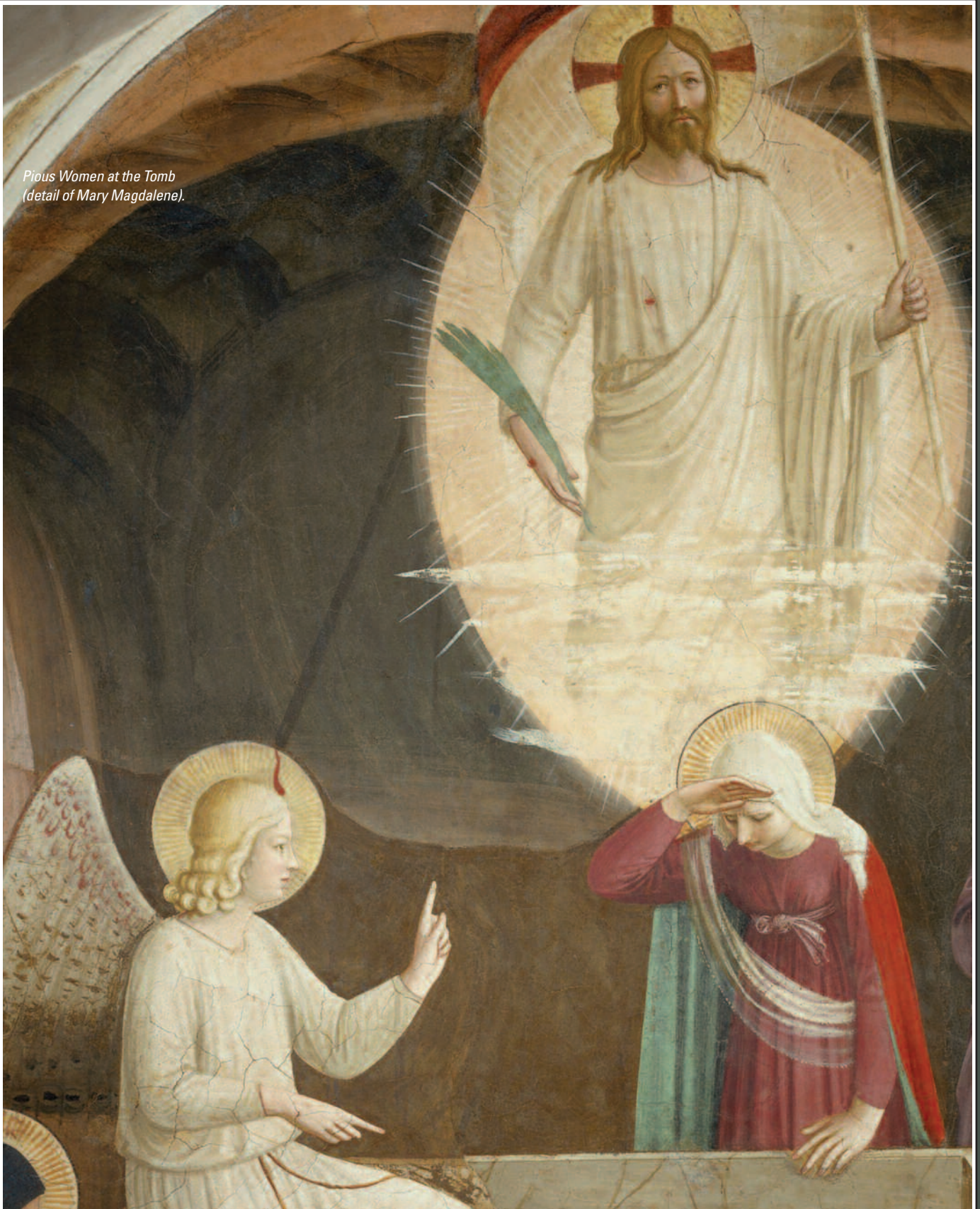
Pious Women at the Tomb (detail of Mary Magdalene).

of everything (school desks, studies, the attempt at university reform, etc.)—gestures that are, above all, gestures of real humanity, i.e., of charity. A new reality is not built by speeches or organizational projects, but by living gestures of new humanity in the present.” Each of us, every com-