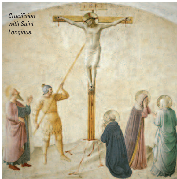
Crucifixion with Saint Longinus.

“Reactive means determined by the moves made by others, not our own, i.e., [in reality] offering initiatives, using ways of speaking, creating instruments that are not generated as an all-embracing method by our new personality, but suggested by the use of words, the creation of instruments, the attitude and behavior of our adversaries.” Since we are still “playing on their home field,” defined by the others, then “a reactive presence cannot help falling into two errors. Either it becomes a reactionary presence, i.e., attached to its own positions as ‘forms,’ without the contents—the motives, the roots—being so clear as to come alive... ; or [it is only an] imitation of others.” Instead, “ an original presence [is] a presence in accord with our originality” (L. Giussani, “From Utopia to Presence,” Traces , Vol. 4, No. 11 [December] 2002, Word Among Us, p. II). That is, presence is the realization of communion with ►►